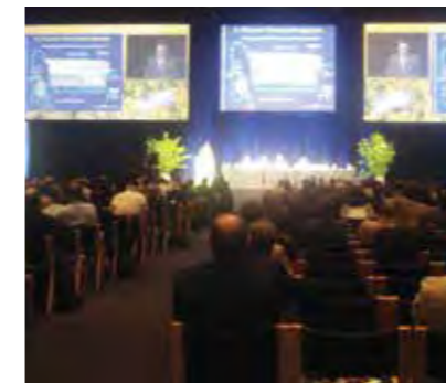
Challenger Presentation 4th Eurasphalt & Eurobitumen Congress Innovation Session