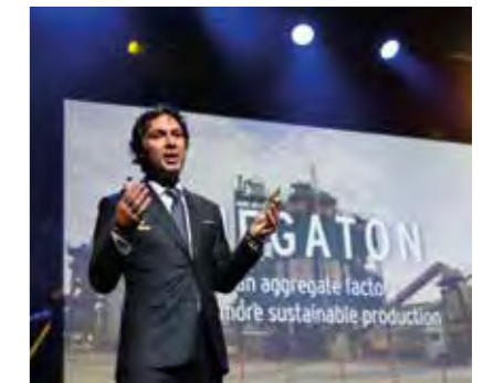
Megaton UEPG Presentation Megaton was introduced to the members of the European Parliament (EP) at the event held in Brussels.