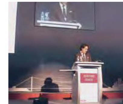
Ratech Presentation 5th Eurasphalt & Eurobitumen Congress Resource Use and Recycling Session